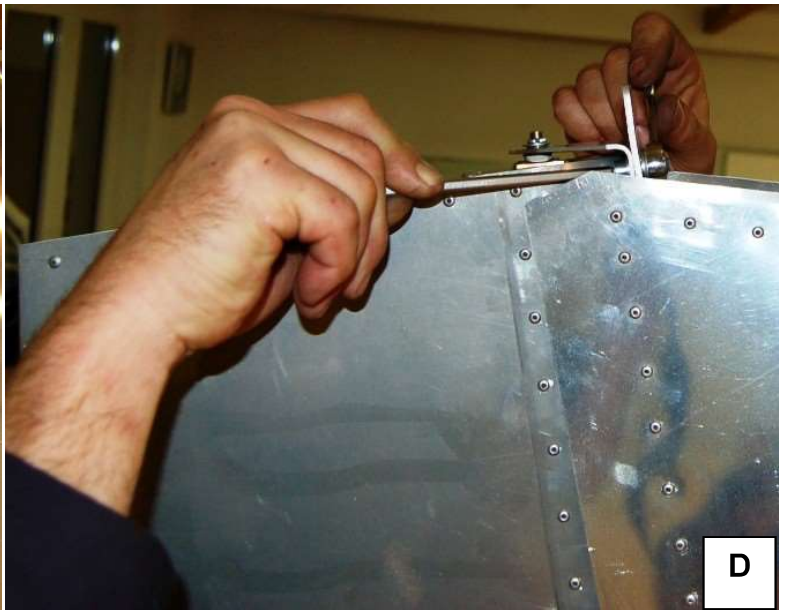
Fig. 48 A, B, C, D